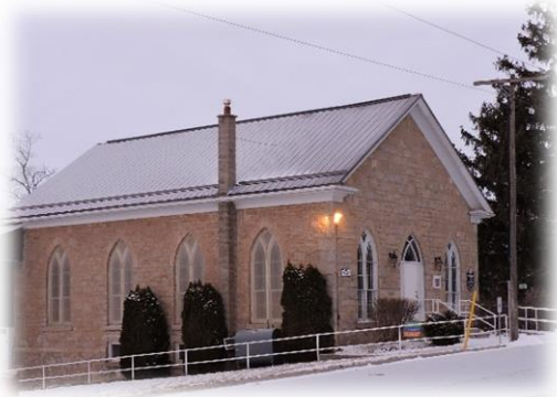
The Little Church with a Big Heart

“Jesus is our Saviour and our example. Through the love and forgiveness of God, we are empowered at Stone United Church to grow spiritually, to love and serve those in our family, church, community and the world. We will express our faith by serving needy families.”