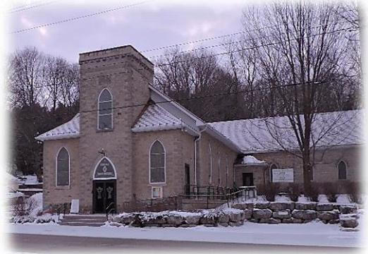
Live, Love, Laugh

“We are the body of Christ, chosen to live together in peace. Shaped by our love of God, nurtured in the life of Christ and embraced by the fellowship of the Holy Spirit, we welcome all to God’s family. Come and live simply, love generously, and laugh freely.”