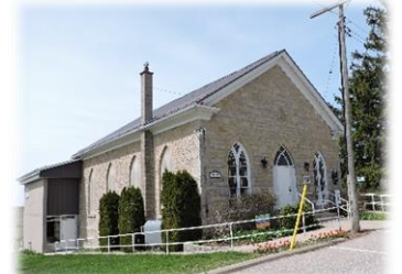
Stone United Church 5370 Fourth Line Rockwood, ON NOB 2K0

Messages are monitored virtually on Thursdays