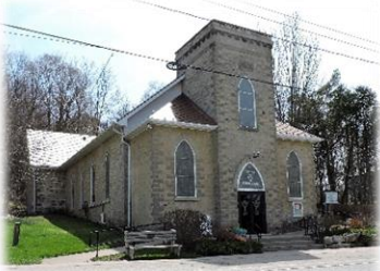
Rockwood United Church 119 Harris St. Rockwood, ON NOB 2K0

Visit our website at www.rockwoodstoneunitedchurches.com