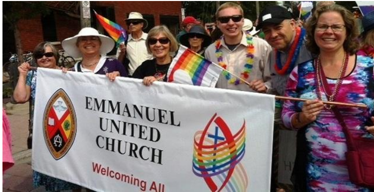
Emmanuel United Church marching in Ottawa Pride Parade

sponsoring 2SLGBTQIA+ refugees, advocating against legislation that negatively impacts transgender youth, and creating vibrant banners to proudly display in Pride parades.